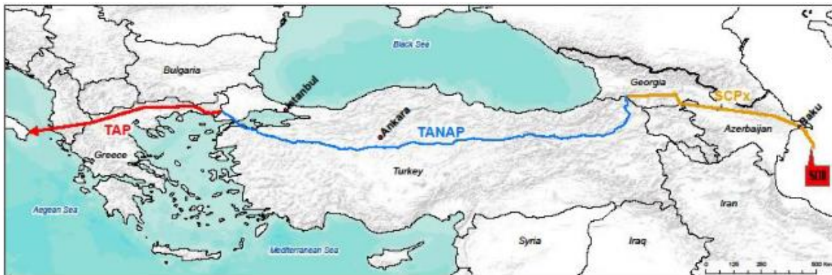
Figure 1: Southern Gas Corridor including the South Caucasus Pipeline (SCP), TANAP and the Trans-Adriatic Pipeline (TAP).

The Southern Gas Corridor comprises the South Caucasus Pipeline (SCP) that crosses Azerbaijan and Georgia, the TANAP across Turkey and the Trans-Adriatic Pipeline (TAP) across Greece and Albania and Italy (Figure 1). The TANAP gas corridor starts from the Georgia/Turkey border at Türkgözü/Posof/Ardahan where it connects to SCP and ends at the Turkey/Greece border in Ipsala/Edirne, where it feeds into the TAP Pipeline.